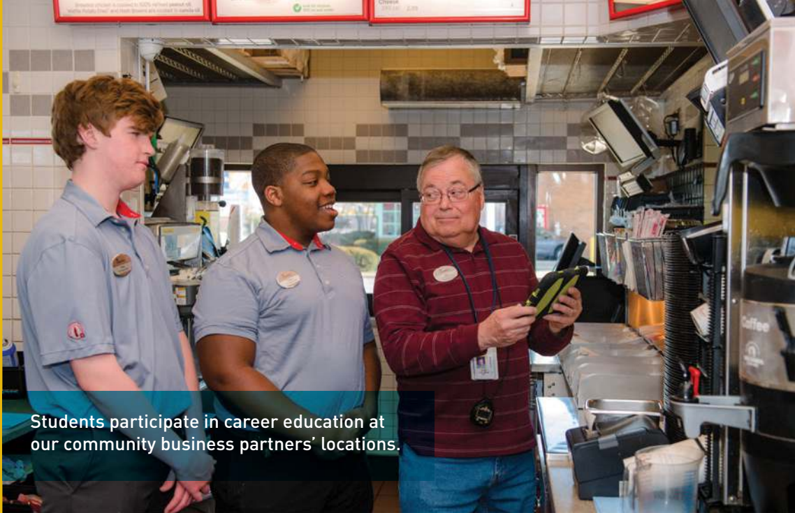
Students participate in career education at our community business partners' locations.