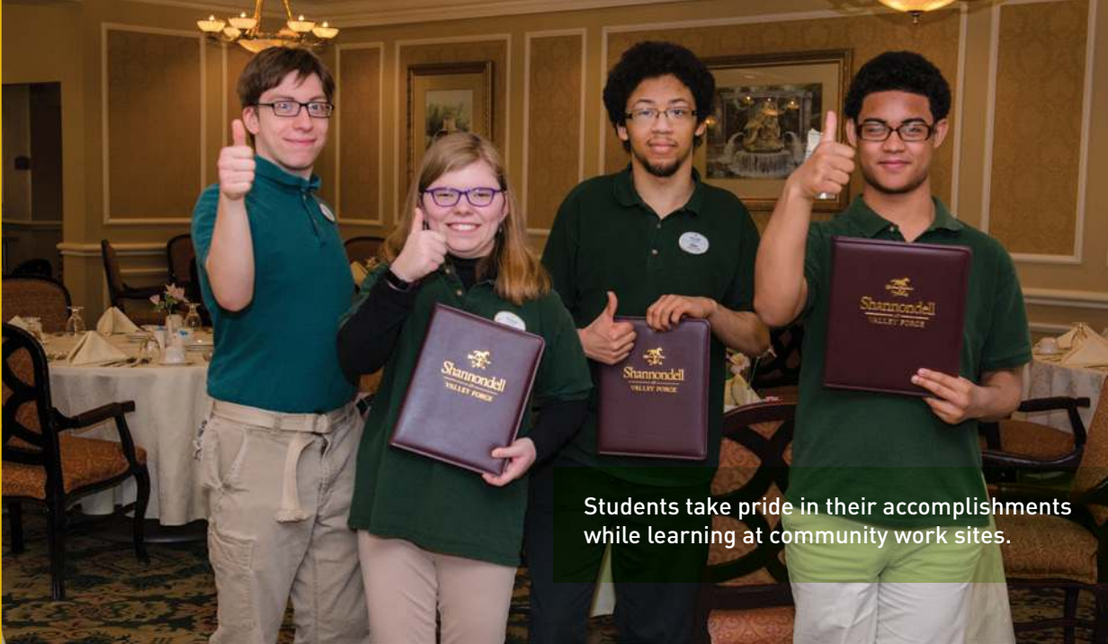
Students take pride in their accomplishments while learning at community work sites.