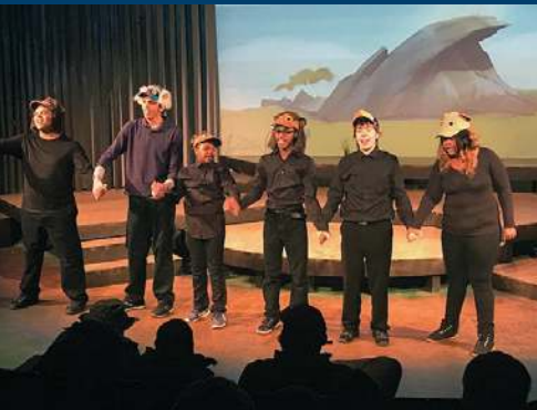
The Lion King

DID YOU KNOW that Pathway's robust drama program includes three productions each year, as well as a Theatre Residency Program with Theatre Horizon in Norristown?