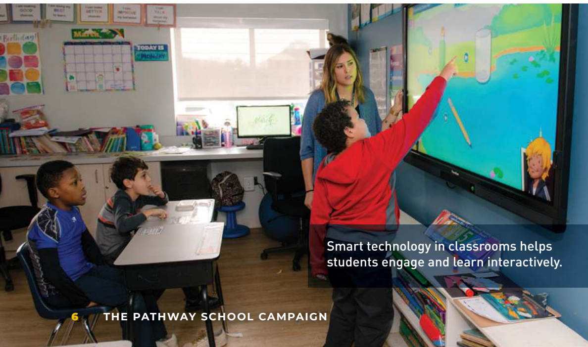
Smart technology in classrooms helps students engage and learn interactively.

The Pathway School Campaign will enable us to provide a “STEM for All” curriculum, fully integrating in-class learning with STEM concepts that are omnipresent in 21st century careers and daily life. As part of this initiative, we will offer expanded on-campus and on-the-job learning opportunities that help students envision themselves in careers, identify post-graduation goals, and chart a path to their future as adults.