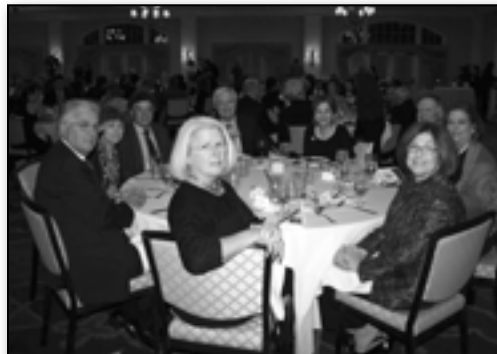
Several Pathway alumni parents, pictured above, celebrated this milestone event in Pathway's history.

On behalf of the entire Pathway community, thank you to all that made this event a huge success!