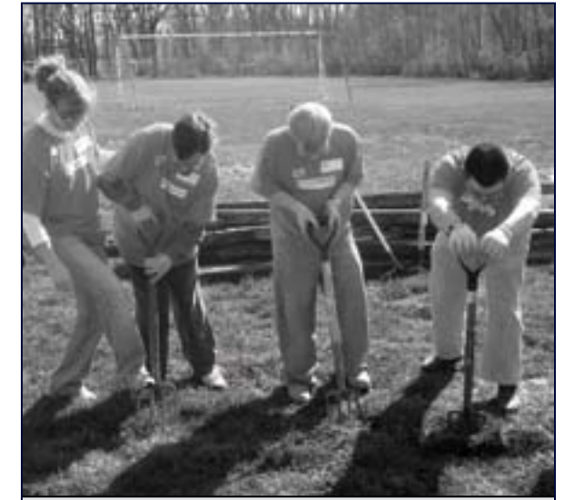
Home Depot and Ken's Krew volunteers prepare to dig a new walkway that leads to the greenhouse.

These improvements will help to re-energize Pathway's horticulture program for both students and staff with the planting of vegetables and herbs scheduled for this growing season. In addition to the Home Depot expertise and physical labor, the flowers, mulch, lumber and other various materials were generously donated by Home Depot!